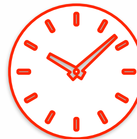
Exhibit Hall is open 24/7 (Oct 12 9am - Oct 14 10am ET)