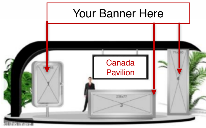
Example of Pavilion. Not an exact replica.