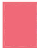
FULL PAGE AD SPECS

High Quality PDF or jpeg 300 dpi, RGB (bleed is not necessary) No Microsoft Word, Publisher or Power Point files will be accepted.