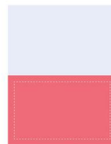
1/2 PAGE HORIZONTAL AD

Trim size: 8.5" x 11" Type Safety Area: 7.5" x 10"